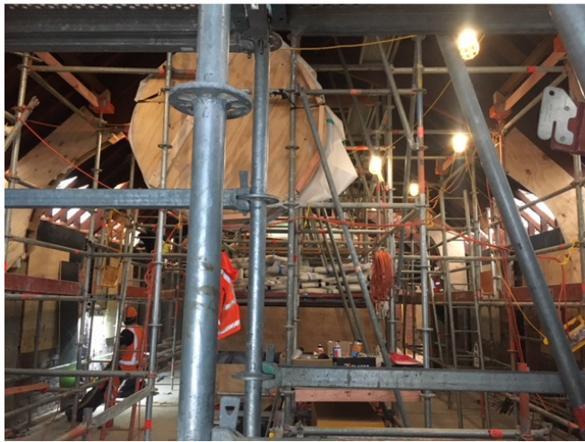
6 th April visit to see progress

The restoration of the Nurses' Memorial Chapel continues. For those who have been passed the Chapel recently you will have noticed that it has been completely encased in white plastic.