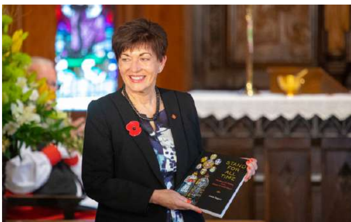
Rt. Hon Dame Patsy Reddy, GNZM, QSO Governor-General of New Zealand

The Chapel Trust and Friends of the Nurses' Memorial Chapel are very grateful to all those wonderful people who have been involved in this very special project.